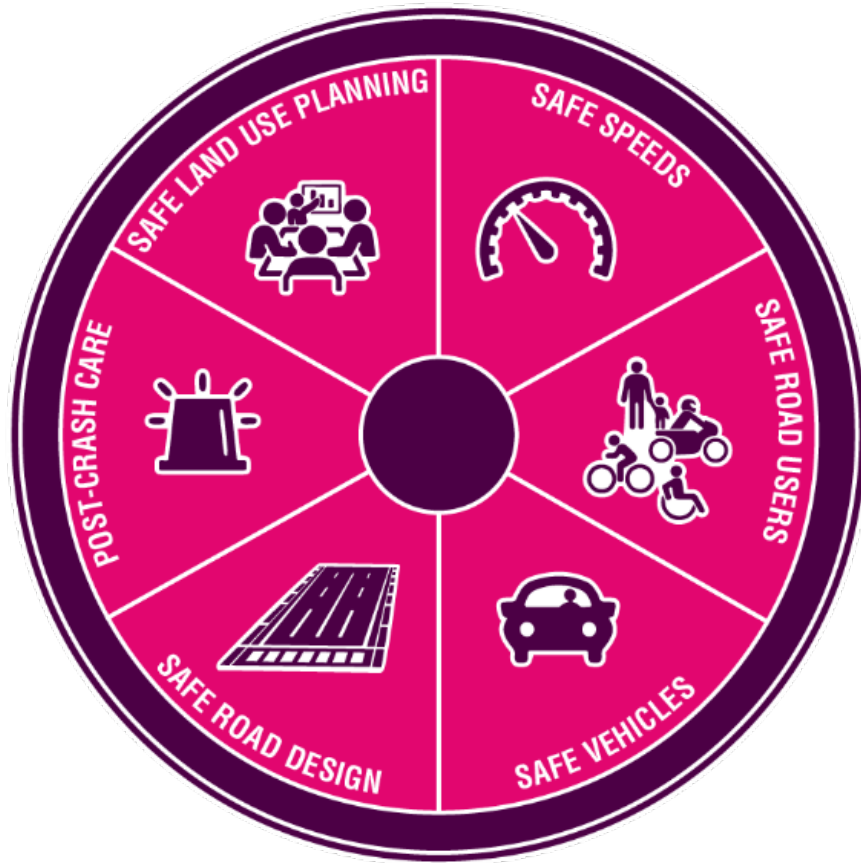
The Safe System Approach